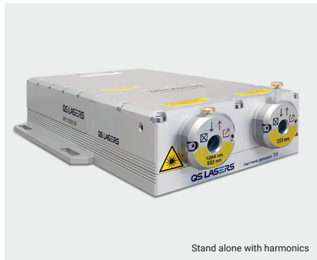
Stand alone with harmonics

MPL15100 series robust DPSS actively Q-switched sub-nanosecond lasers deliver multi-kW peak powers, less than 1 ns pulse duration at 1 kHz repetition rate. Short innovative laser cavity with is fixed on thermo-stabilized baseplate which gives extremely stable output parameters performance. Small footprint is welcome point for integration into OEM lasers. Sub-nanosecond pulse duration of < 700 ps with near transform limited spectral linewidth at repetition rates up to 1 kHz with low timing jitter of < 200 ps and energies more than 500 µJ covers broad spectrum of applications starting from LIBS, laser induced fluorescence to many others. Standard optional harmonics generator to green (532 nm) and ultraviolet (355 nm, 266 nm) is also available.