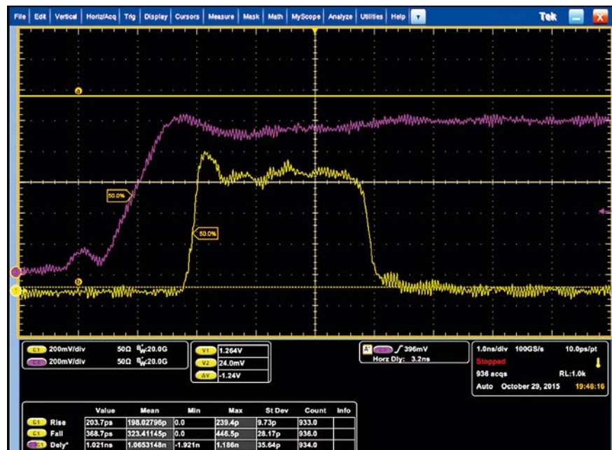
Fig 3. Jitter measurement results

Note: Laser must be connected to the mains electricity all the time. If there will be no mains electricity for longer than 1 hour then laser (system) needs warm up for a few hours before switching on.